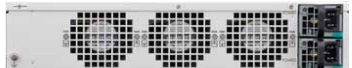
FortiGate-3040B Appliance (Back)