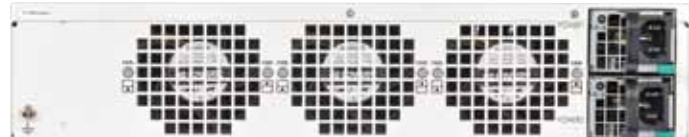
FortiGate-3140B Appliance (Back)