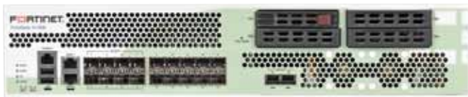
FortiGate-3140B Appliance (Front)