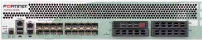
FortiGate-3040B Appliance (Front)

FortiGate-3140B appliance includes the custom FortiASIC Security Processor (SP) chip. The FortiASIC SP2 provides additional intrusion prevention system (IPS) and firewall acceleration for the most demanding environments.